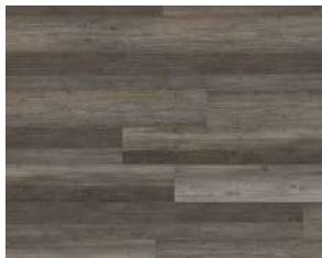
Timber Grove PS8920