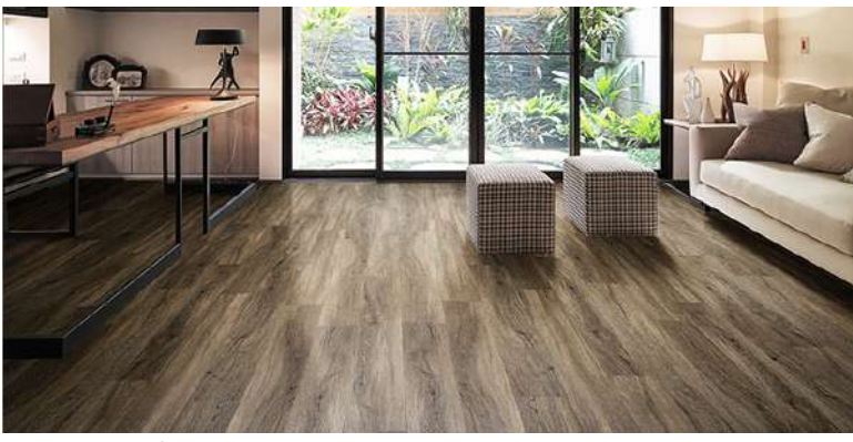
Ancient Oak CW681V