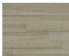
Urban Walk CWH5807