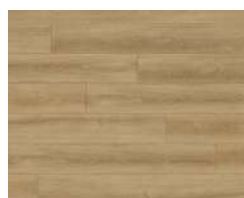
City Vibe CWH5601