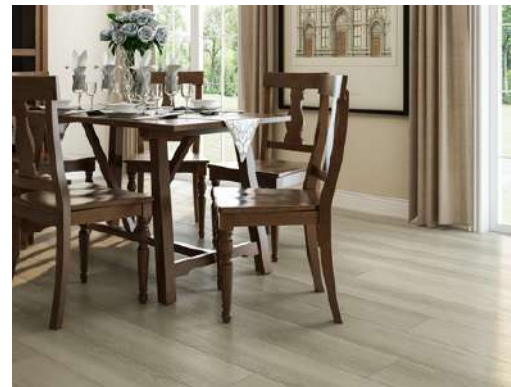
Urban Walk CWH5807