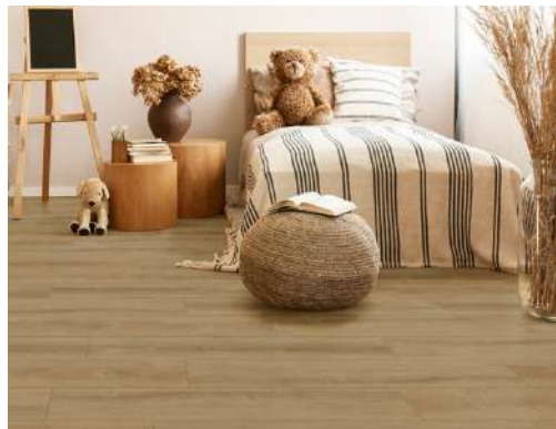
City Vibe CWH5601