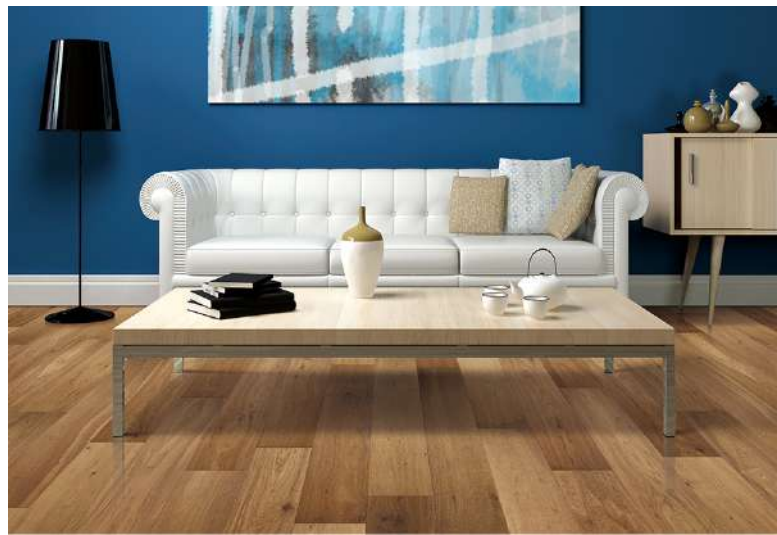
Bar Harbor AC387BH