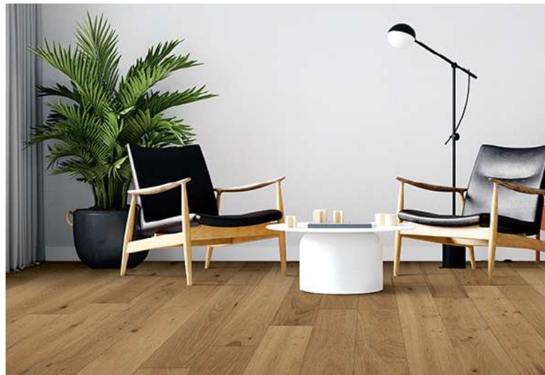
Jersey Shore AC387JS