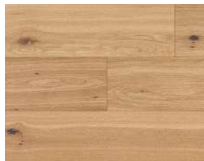
Boca Grande AC387BG