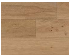
Jersey Shore AC387JS