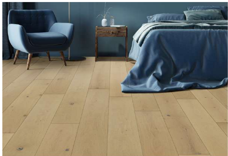
Seaport Bay AC387SP