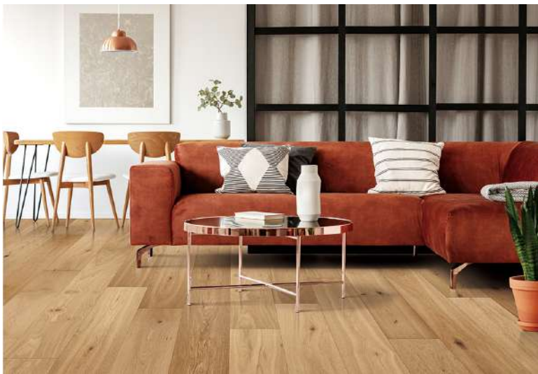
Boca Grande AC387BG