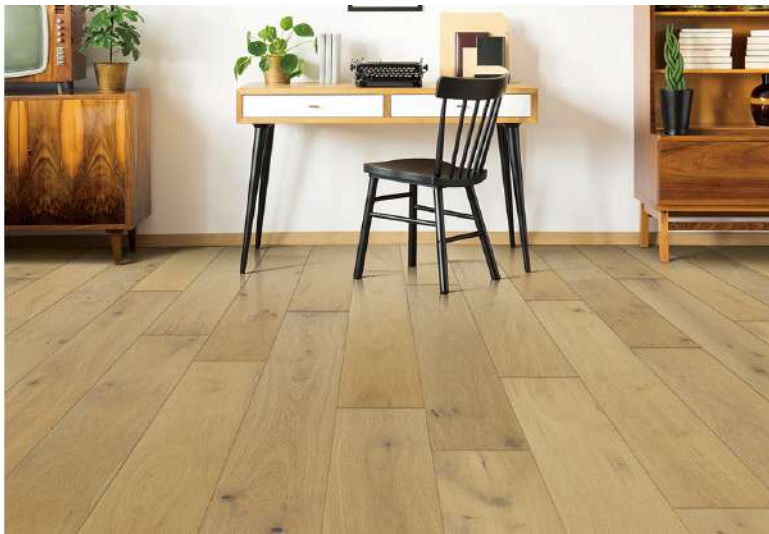
Heritage Wharf AC387HW