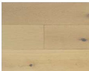
Seaport Bay AC387SP