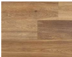
Bar Harbor AC387BH